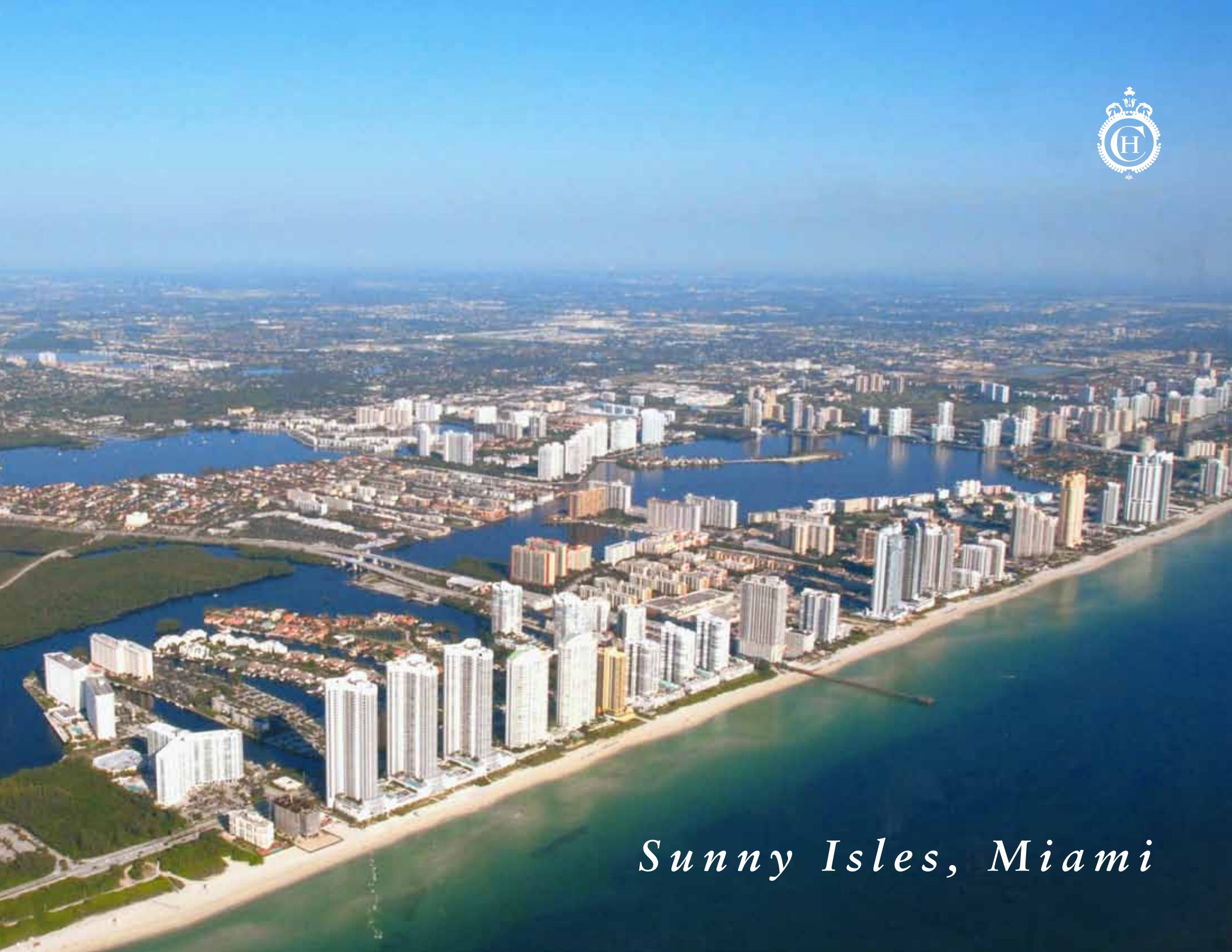
Sunny Isles, Miami