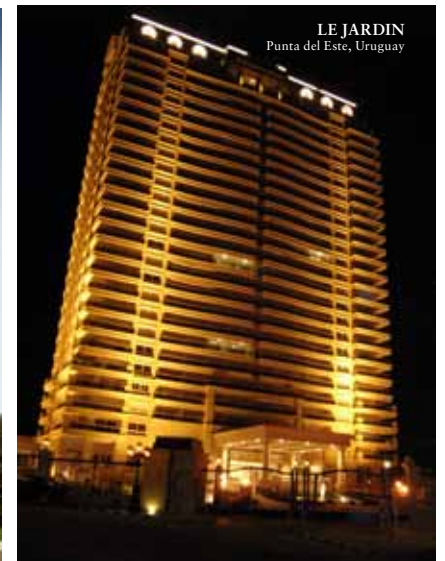
LE JARDIN Punta del Este, Uruguay