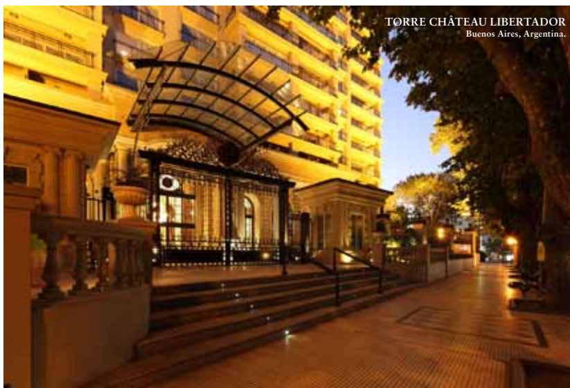
TORRE CHÂTEAU LIBERTADOR Buenos Aires, Argentina.