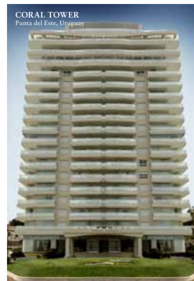
CORAL TOWER Punta del Este, Uruguay